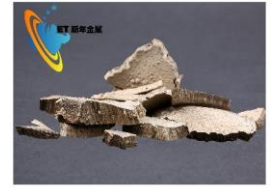
金属镱 CAS NO.7440-64-4